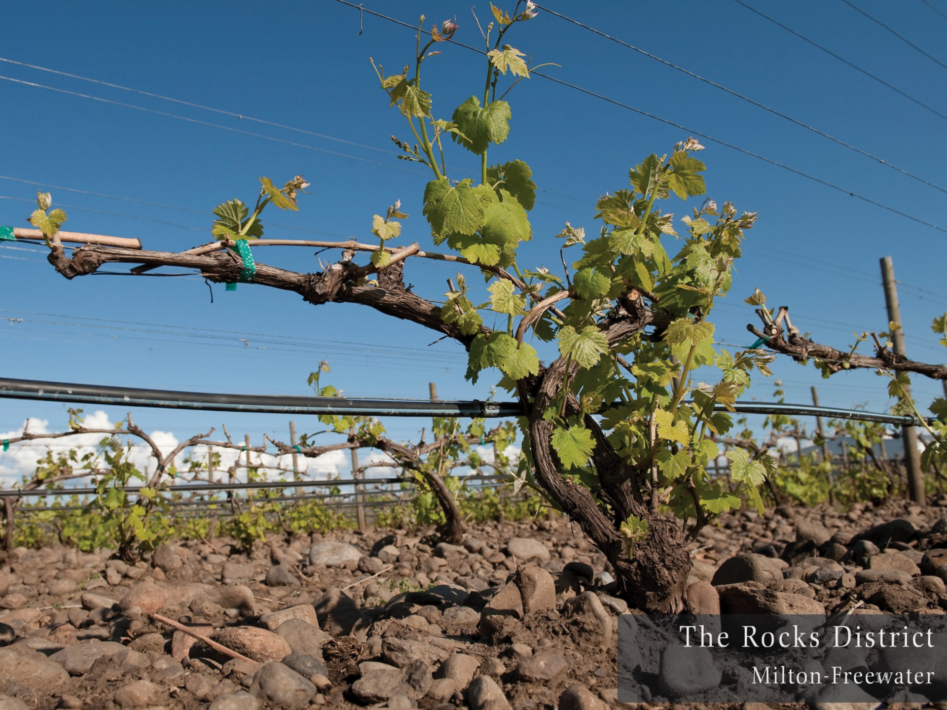
The Rocks District Milton-Freewater